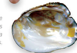
Hyriopsis cumingii, or hybrid

Freshwater pearls are usually cultured in lakes and ponds, and have a wide range of colors.